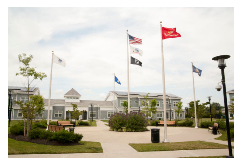
Developed by: Concern for Independent Living